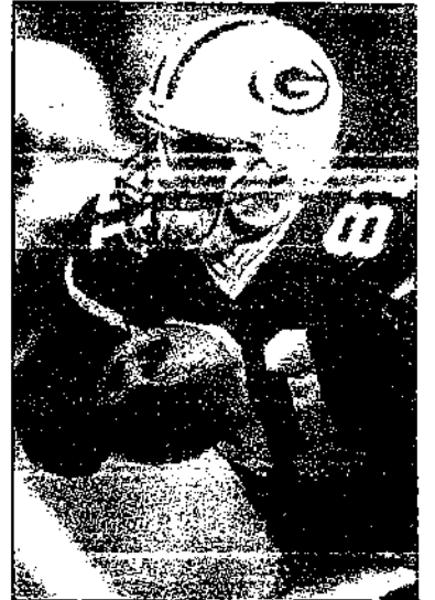
DESMOND HOWARD ... super MVP

It was a high-powered Pack — doing it with big plays, especially by Desmond Howard, the castoff college star whose 99-yard kickoff return turned the game and won him the MVP trophy. He capped it with his abbreviated Heisman pose — he won that award 1991 — a dagger in the heart of the Patriots after they had closed within 27-21.