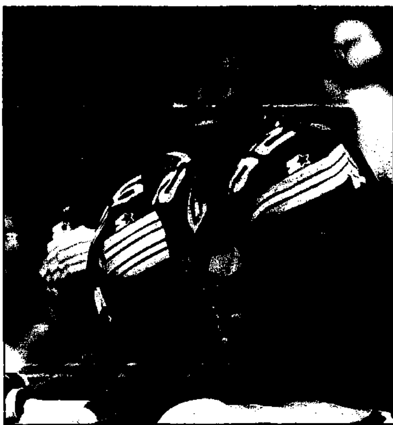
Reggie White of the Green Bay Packers checks the scoreboard during the second quarter of Super Bowl XXXI against the New England Patriots on Sunday.

"We had to keep calm and keep our poise," the 35-year-old White said. "When you play against Bill