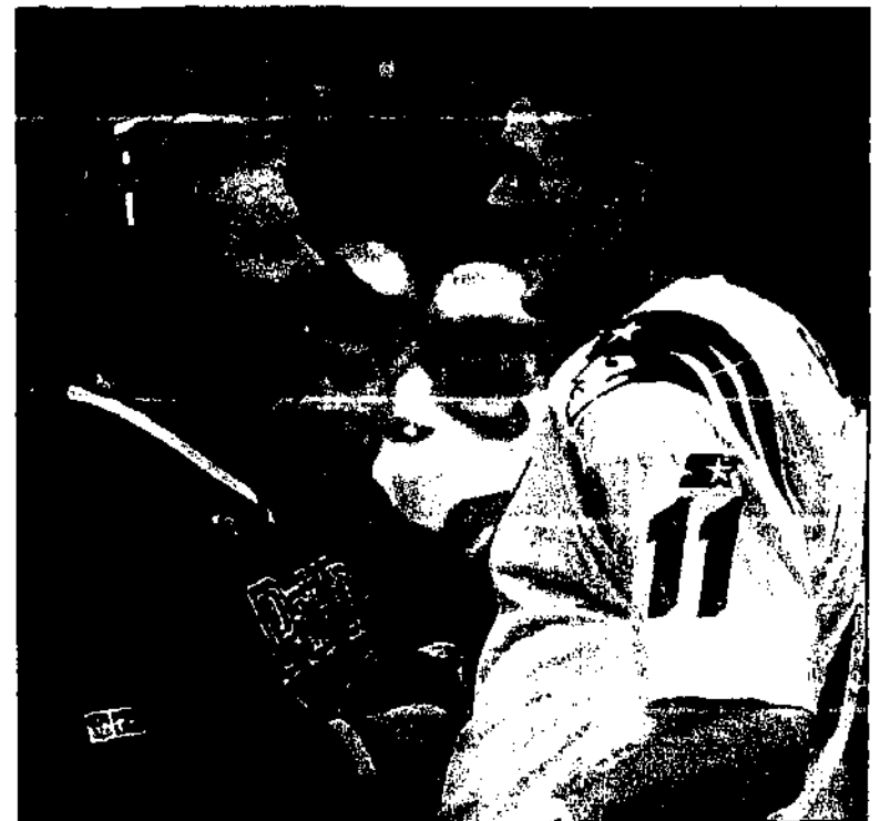
New England Patriots head coach Bill Parcells (left) congratulates quarterback Drew Bledsoe after Bledsoe threw a first quarter touchdown pass against the Green Bay Packers in Super Bowl XXXI on Sunday.

Parcells was heading into the fourth year of a five-year contract last summer when he asked owner